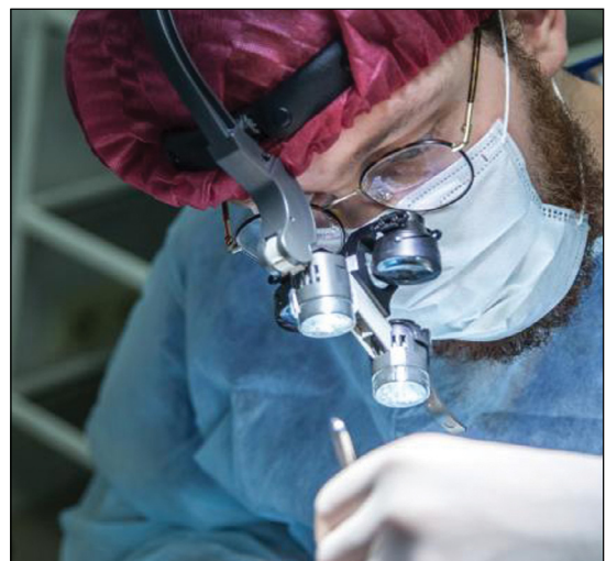
A better understanding of the Piezo channel could lead to new approaches for treating and preventing glaucoma.